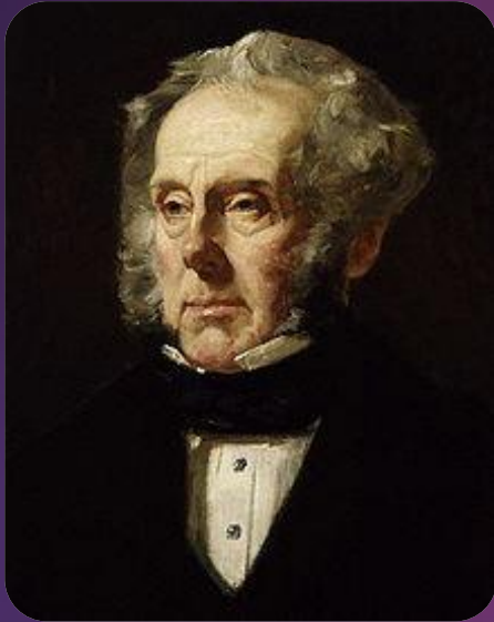
Henry John Temple Viscount Lord Palmerston (1784-1865, Foreign Secretary and Prime Minister under Queen Victoria)

“We have no eternal allies, and we have no perpetual enemies. Our interests are eternal and perpetual, and those interests it is our duty to follow...”